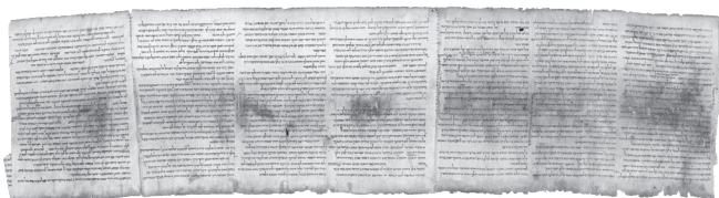
The Isaiah Scroll, designated 1QIsaa and also known as the Great Isaiah Scroll, is one of the seven Dead Sea Scrolls that were first recovered by Bedouin shepherds in 1947 from Qumran Cave 1.

But in the past two centuries archaeologists and other scholars have found thousands of earlier biblical manuscripts. Most famously, a large number of biblical manuscripts were discovered in the middle of the twentieth century in caves near the Dead Sea, not far from Jerusalem. These Dead Sea Scrolls date from the time of Jesus and even before Him—almost a thousand years earlier than the Old Testament manuscripts known before this discovery. The differences between the Dead Sea Scrolls and the later manuscripts of the Hebrew Old Testament text are almost entirely minor verbal differences. Archaeologists have also found papyrus manuscripts of the New Testament dating from the second and third centuries AD, just a century or two after the books were originally written.